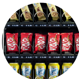
High visibility cell