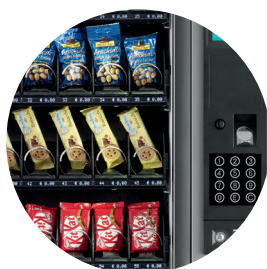
An elegant and uncluttered design