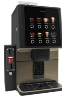
Validator module kit Ready to install a coin validator