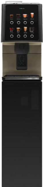
Base cabinet kit Ready to install a coin validator (850 mm)

It is also the perfect solution for a coffee service in convenience stores as well as for hotels, where breakfast needs to be good but also fast. It offers a pleasurable experience with an attractive, simple and functional design.