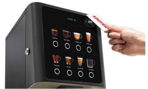
RFID Reader Kit For product recharge card or cashless systems