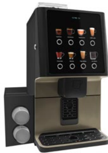
Cup module kit For dispensing cups