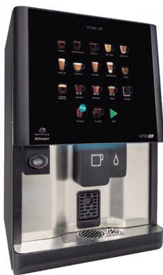
MDB cashless system integration kit

For stand-alone operation, the Vitro S5 MIA allows the inclusion of a cashless system or a separate change giver pod. In addition, it is compatible with the Pay4Vend application that allows payment to be made directly from a mobile phone.