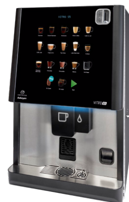
External MDB payment module