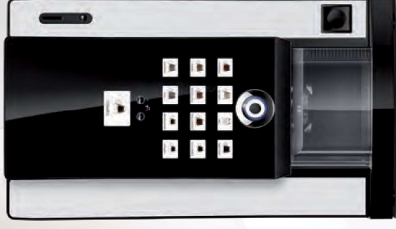
rhea BL doppio & cup top of the line

The external transparent coffee bean hopper, like an open invitation to enjoy fresh-ground coffee, makes this a truly professional-quality machine.