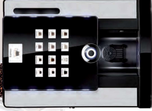
rhea BL grande who freshness you can see

Hybrid technology with the Xtra canister for personalized products like Fairtrade Instant or lactose-free powdered milk.