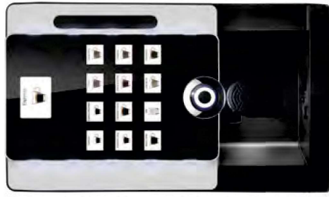
rhea BL eC hi-tech meets Italian style

Because all models are equipped with variflex brewing technology, the Business Line guarantees remarkably light and delicious Italian coffee specialities like classic espresso, cappuccino and latte macchiato, or international styles like American coffee and café crème.